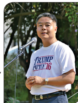
Ted Lieu US Congress District 33

Ted Lieu , US Congress District 33 wearing a "Trump/Putin 2016" T-shirt was passionate about the humanitarian catastrophe in Yemen that experts show is primarily due to the Saudis. From his standpoint as a former prosecutor, he explained in detail how cases against Trump, Jr and Kushner could be built using information we now have. Congressman Lieu also was gracious enough to swear in our PV Dem 2017-2018 club officers.