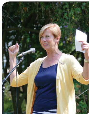
Janice Hahn LA County Supervisor District 4

has introduced 5 bills designed to improve the safety of the Torrance refinery and was one of the authors of the recently passed Cap and Trade bill.