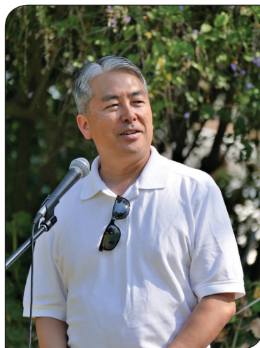
Al Muratsuchi CA State Assembly District 66